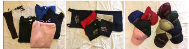
Zipped Hoodies $40