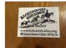
Decals Large $15 * Small $3

For information on purchasing please call Stephanie Stott at