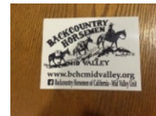
Decals Large $15 * Small $3