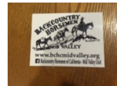
Decals Large $15 * Small $3