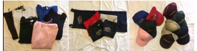
Zipped Hoodies $40