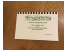
Trail Books $10