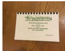
Trail Books $10