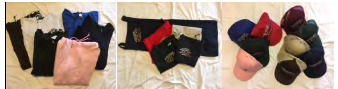
Zipped Hoodies $40