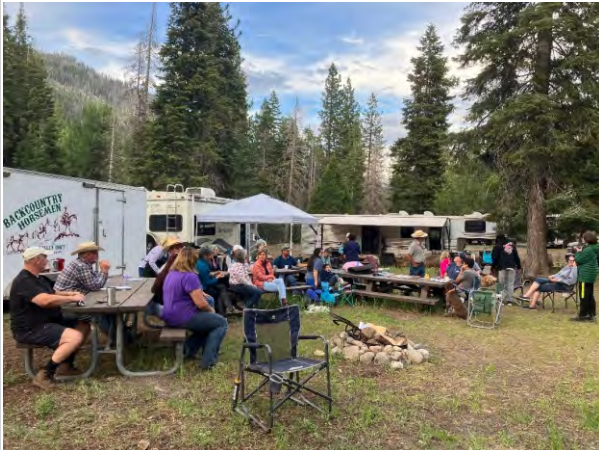
Auction at Clark Fork

This campout took a great deal of cooperation from our members, from set up to tear down. A great big "Thank you" to everyone who helped!