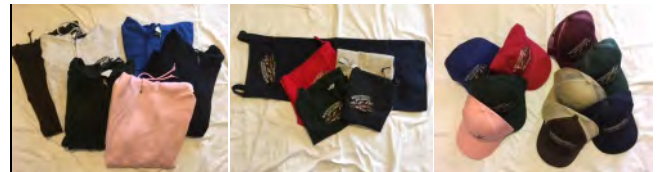
Zipped Hoodies $35