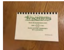
Trail Books $10