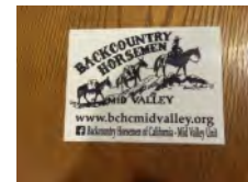
Decals Large $15 * Small $3