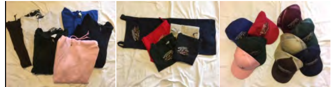
Zipped Hoodies $35