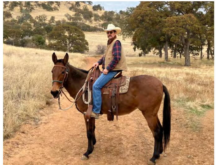
The influence that BCHC has had on me. This is my new ride Oakley, a mule.