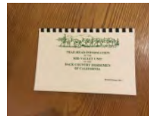
Trail Books $10