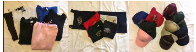
Zipped Hoodies $40