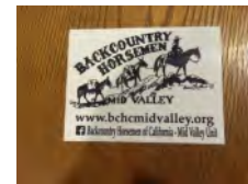
Decals Large $15 * Small $3